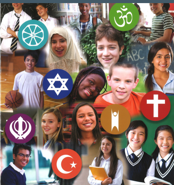
Guidelines on the Inclusion of Students of Different Beliefs in Catholic Secondary Schools